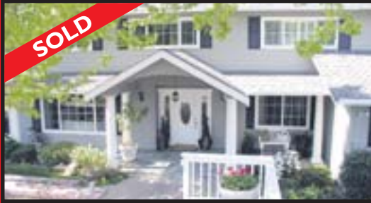
95 Scenic Drive, Orinda