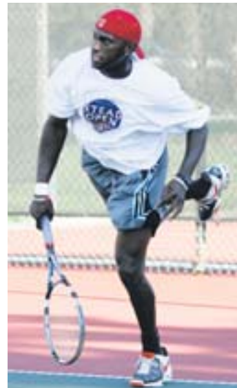
Stead Open 2008

While swimming is often the focus of the summer season, the Moraga Country Club has not forgotten that the tennis season