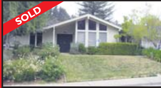
3718 Campolindo Drive, Moraga