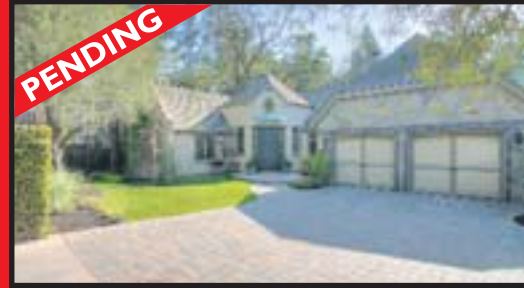
1168 Upper Happy Valley Road, Lafayette

direct: 925.890.6911 email: nancystryker@gmail.com web: www.thebeaubellegroup.com address: 2 theatre square suite 211 orinda