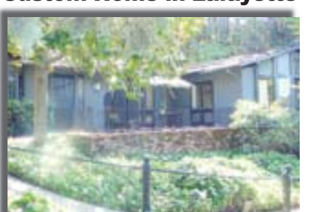
$1,050,000 3 bedrooms, 3 baths, 2400 sq. ft. .52 acres - Call for private showing

Call today for a personal Rossmoor tour, informational packet and complimentary lunch with us.