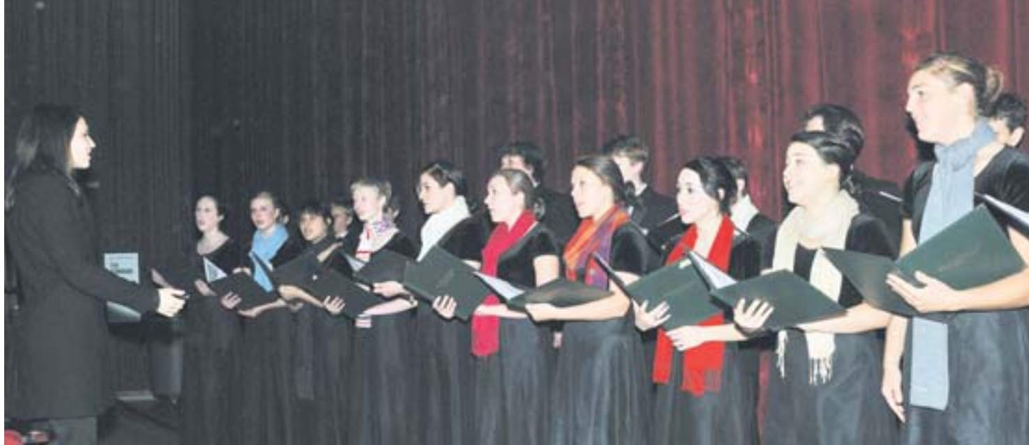
Miramonte High School's Chamber Choir performed at the Orinda Theater before the White Christmas screenings