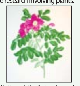
A Watters painting that can be seen in the Berkeley exhibition

Established in 1890, the Garden, which is open to the public year round, has over 13,000 different kinds of plants from around the world, cultivated by region in naturalistic landscapes over its 34 acres. The garden conducts 100 programs every year with topics including native plant dyes, orchid division, bird walks and much more. The garden protects rare plants and conducts extensive research involving plants.