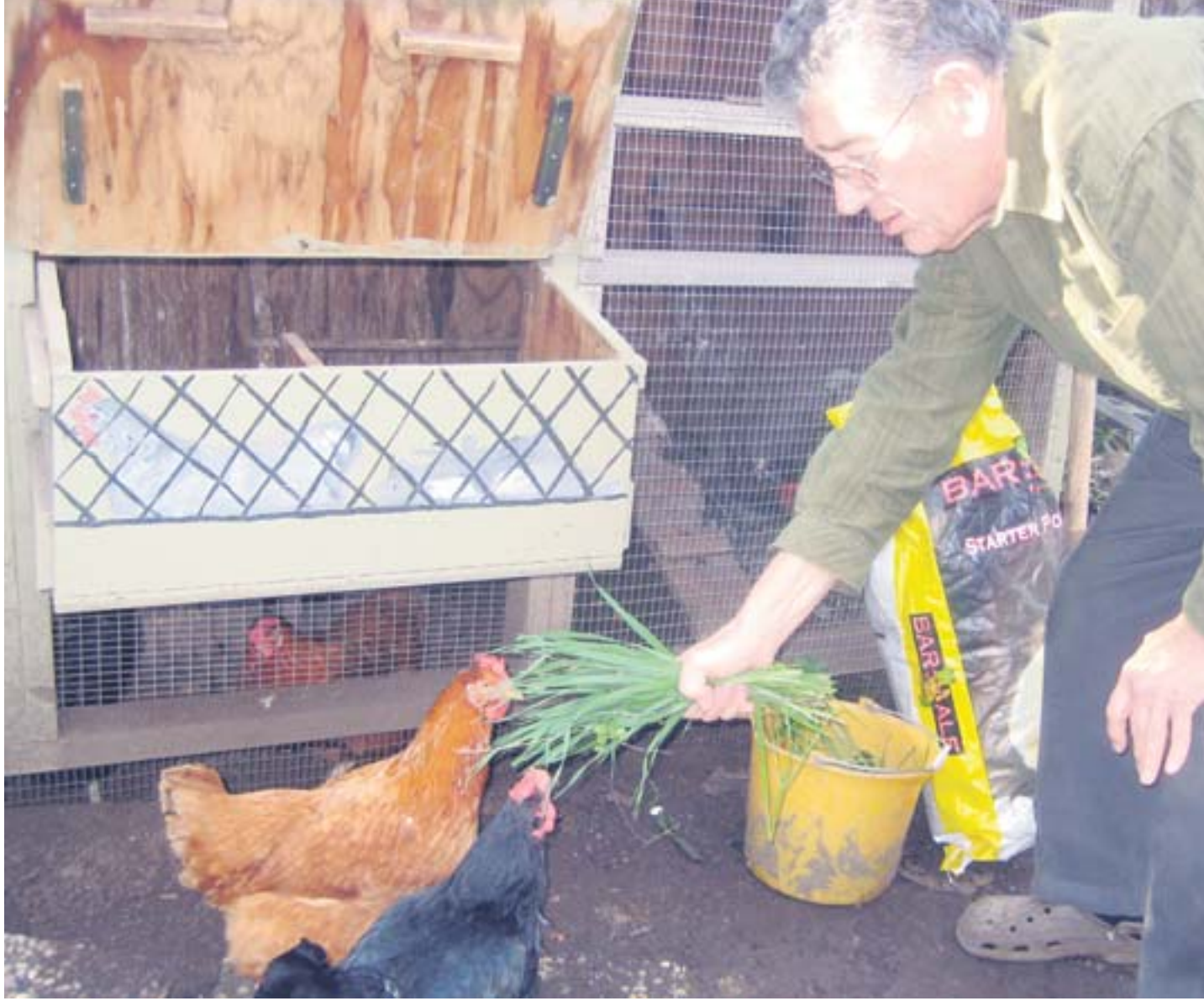
Chickens need to eat plenty of greens

More than half of the participants in the workshop were from Lafayette.