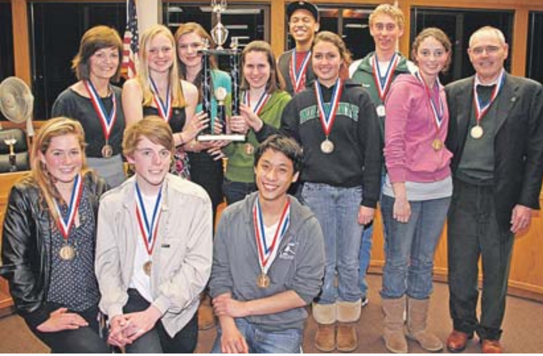
The Miramonte Mock Trial team

n March 4, Miramonte High School was named Contra Costa County's Mock Trial Champion. Held at the Contra Costa County Office of Education (CCCOE), the crowded room gave hearty congratulations to the team, and plenty of encouragement for their upcoming matches in the California State Mock Trials. This was Miramonte's 4th Mock Trial County Championship in a row.