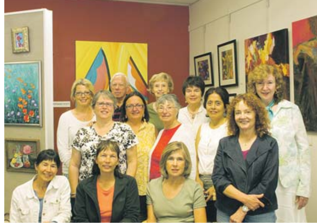
Moraga Art Gallery members