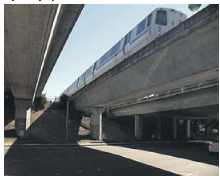
Bart bridge over Oakhill Road