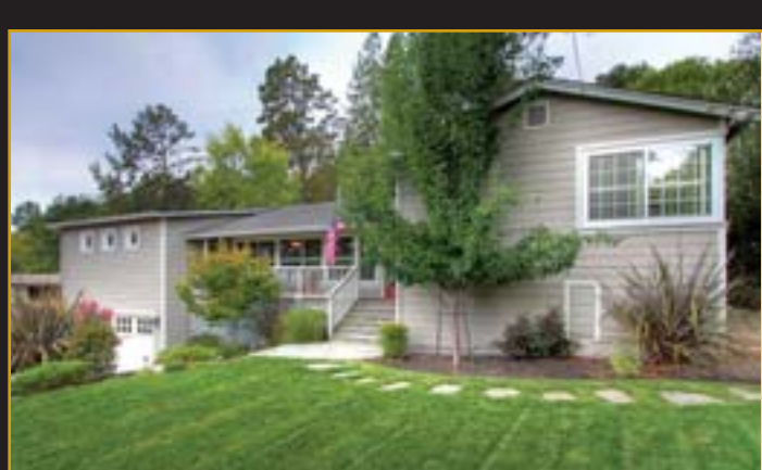
9 Las Vegas Road, Lafavette Shown by Appointment

This Orinda Country Club home combines California indoor/ outdoor living and an elegant, contemporary style. Completely updated with high quality appliances & materials throughout, this home is ready for its next owner. An open floor plan, light and bright living spaces, along with a perfectly appointed chef's kitchen make this a home for just about everyone.