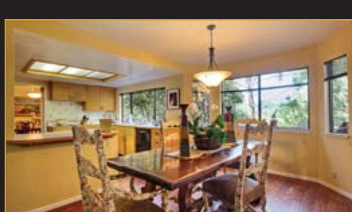
649 Miner Road, Orinda Shown by Appointment

This serene, contemporary home is situated on a 1+/-acre lot near downtown Orinda Village and Orinda's great schools. The outdoor decking and yard overlook an oak woodlands open space which creates a private wooded setting for the home. Over 3100sf of living space, great storage, a 3-car garage and fabulous hardwood flooring make this home a wonderful buy. $899,000 Shelly Rae Ruhman open.apr.com 925.258.1111