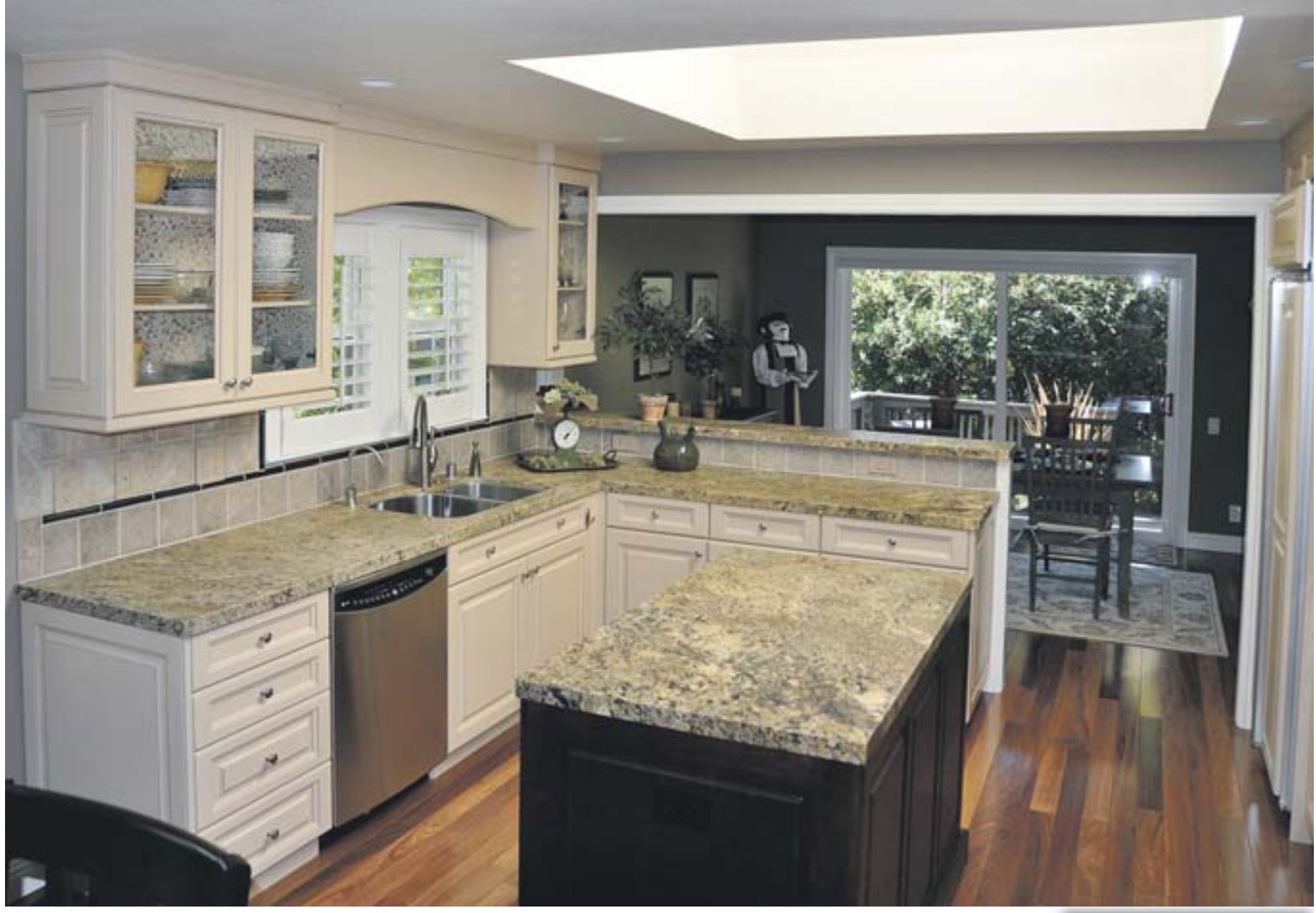
Carol and Gerry Tanner's kitchen glows warmly under natural light from the skylight above.