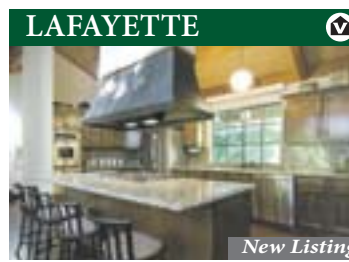
819 Las Trampas Road Enchanting Lafayette retreat. Custom built 4bd/4.5bath 3548 sf home on gorgeous 1-acre lot in sought after Las Trampas. Country quiet yet steps to town, trail and school