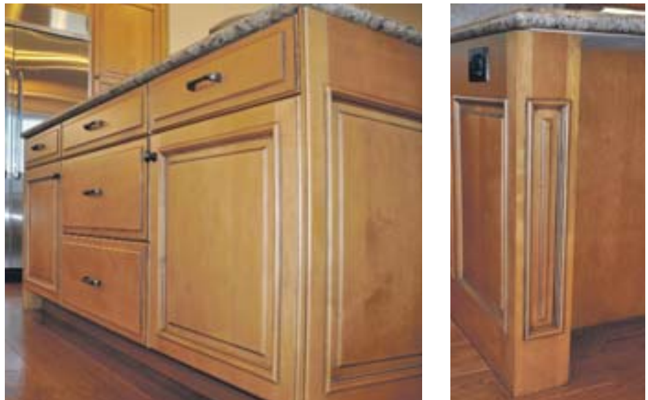
The beveled counter top and detailed cabinetry add charm to the Bruzzone kitchen.

The 2010 tour is Thursday, October 7, from 5-8 pm . Tickets are $20 and are tax deductible. Wine, appetizers and resource information will be available at each location. For more information, visit http://www.mcchometour.com/#1.