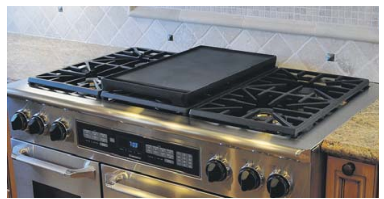
The Bruzzones' range sports a large griddle.

The 2010 tour is Thursday, October 7, from 5-8 p.m . Tickets are $20 and are tax deductible. Wine, appetizers and resource information will be available at each location. For more information, visit http://www.mcchometour.com/#1.