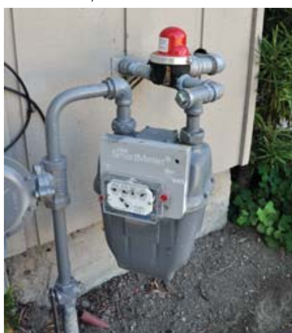
Gas meter with seismic valve

Williams says homeowners and renters should ask