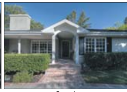
Orinda $1,625,000 4/3.5