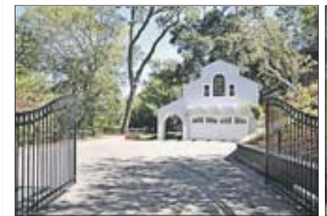
Orinda $1,575,000 5/4