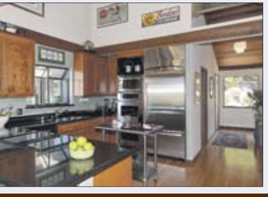
88 Sunnyside Lane, Orinda