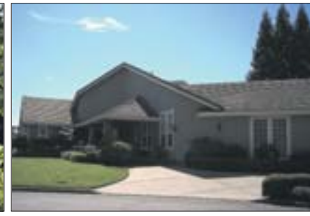
Lafayette $1,638,000 4/3.5