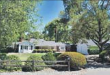
Lafayette $1,350,000 4/3