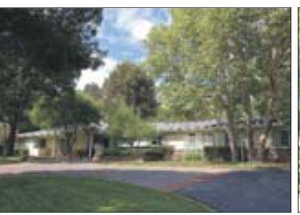
Lafayette $1,495,000 5/4