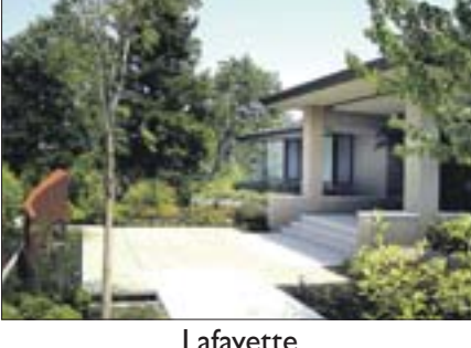
Lafayette $8,500,000 7/9

Coldwell Banker takes your home global with its award winning websites