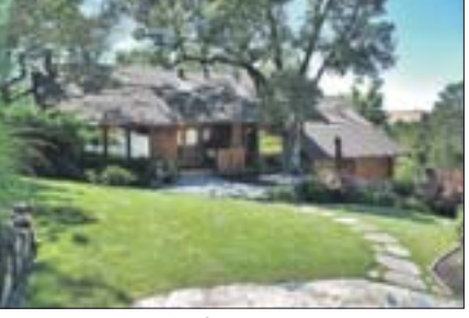
Lafayette $1,595,000 4/4