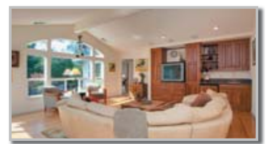
NEW LISTING! 1090 Larch Avenue, Moraga 4 Bedrooms, 3 Baths, 2737± Sq. Ft. Offered at $949,500