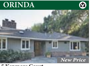
5 Kenmore Court

This house works for you! Solar panels & inlaw unit w/full kitchen allows you to put money back in your pocket. 1.19 beautiful acre lot, 2500 sf. 4bd/3 full baths