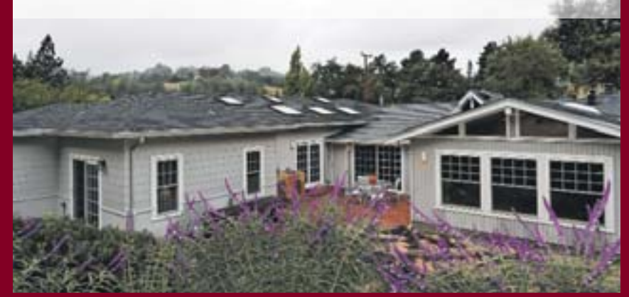
3919 South Peardale Drive, Lafayette

Fabulous single story updated home, filled with an abundance of natural light. Some features include 6 bedrooms 4 baths, lovely hardwood floors, and vaulted ceilings. Gracious access to the level yard and patios provide wonderful indoor/outdoor living and entertaining. One of Lafayette's most desirable