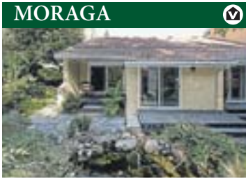
1746 St. Andrews Drive

Beautifully remodeled level 3bd/2ba townhome with high ceilings, frplc, attached garage & EZ indoor/outdoor living. Pvt yd includes waterfall,