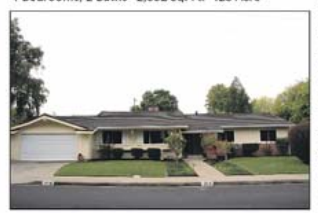
Offered at $739,000

4 Bedrooms, 2 Baths 2,032 Sq. Ft. .23 Acre