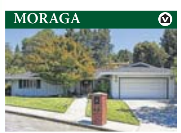
20 Kazar Court

Special custom upgrades & pride of ownership! 4/2.5 cul-de-sac rancher w/hardwood floors, plantation shitters, great curb appeal. Patio & terraced