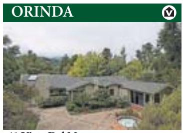
41 Vista Del Mar

3500 sf custom 4 bd/3ba w/attached in-law on mostly level .58 acre in top area w/privacy, grassy lawns & total convenience. Warmly styled, architect designed.