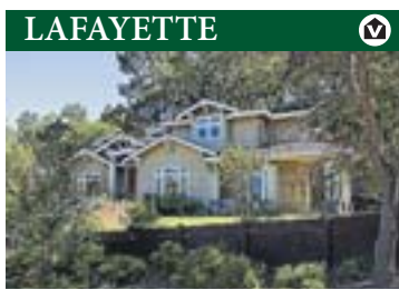
3407 Shangri La Road

Fabulous Craftsman style built in 2005, Stunning architecture, beaut craftsmanship, all the finest