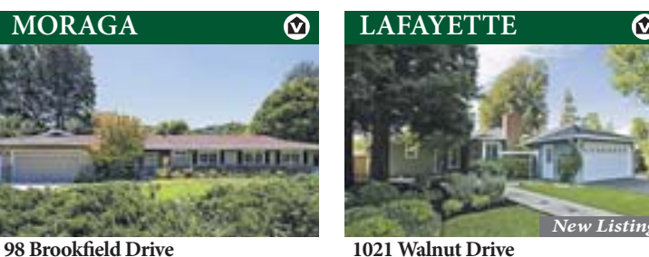
1021 Walnut Drive Lovely 5bd/3ba on level desirable Moraga cul de

Delightful downtown charmer. Complete 2007 remodel, Fabulous lovely 3bd/2ba home, hdwd