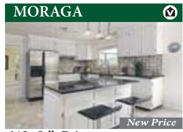
24 La Salle Drive

Incredible value! Lovely 5bd sgl lvl custom hm. Gorgeous pvt 1/2 ac lvl knoll. Pool, lawn,