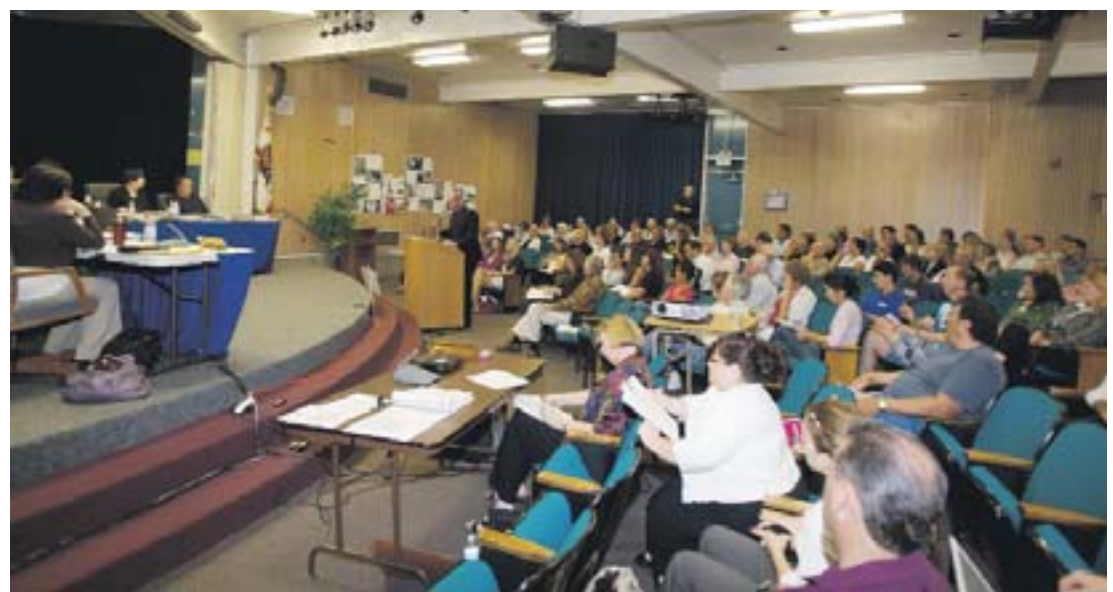
Many residents came to the Council meeting to discuss the Dollar Tree.