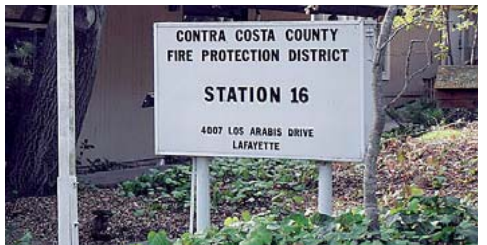
Station 16, at risk of closure

ithout a parcel tax next year, up to eight fire stations could close said Fire Chief Daryl Louder at a recent Board of Supervisors workshop, due to a projected $12 million budget shortfall for fiscal year 2010/2011.