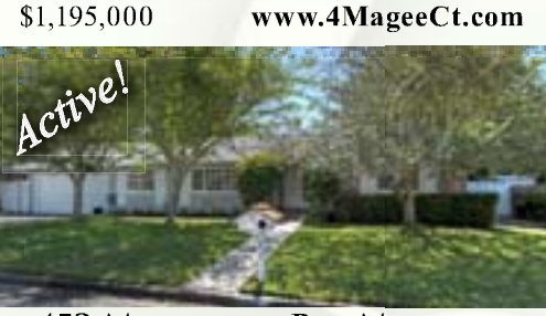
452 MILLFIELD PL., MORAGA

Single level 4 Br, 3 Ba 2740 sqft with pool, spa and level backyard.