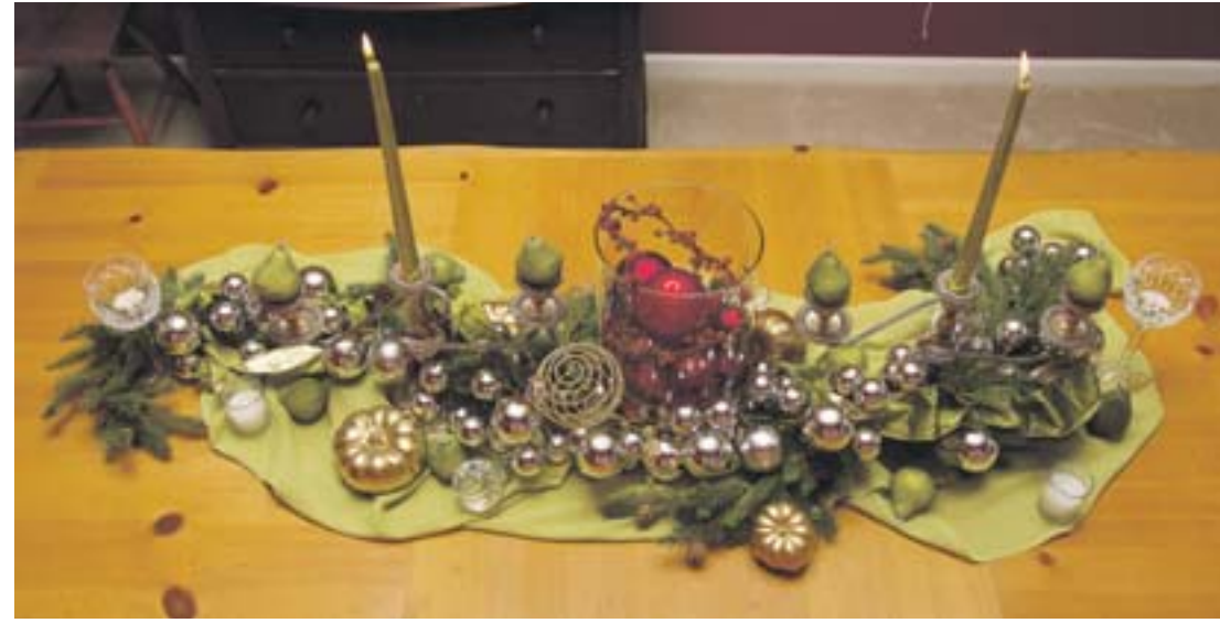
Table centerpiece display by Nikolene Isely.