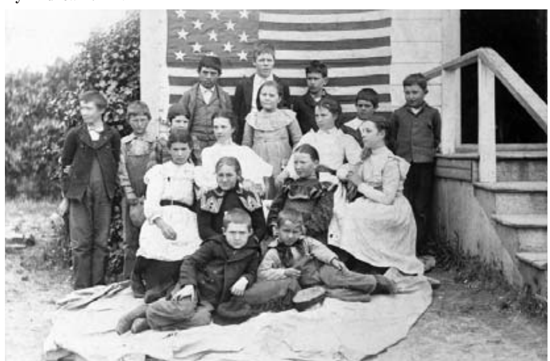
Orinda Park School, Group Portrait, 1900.