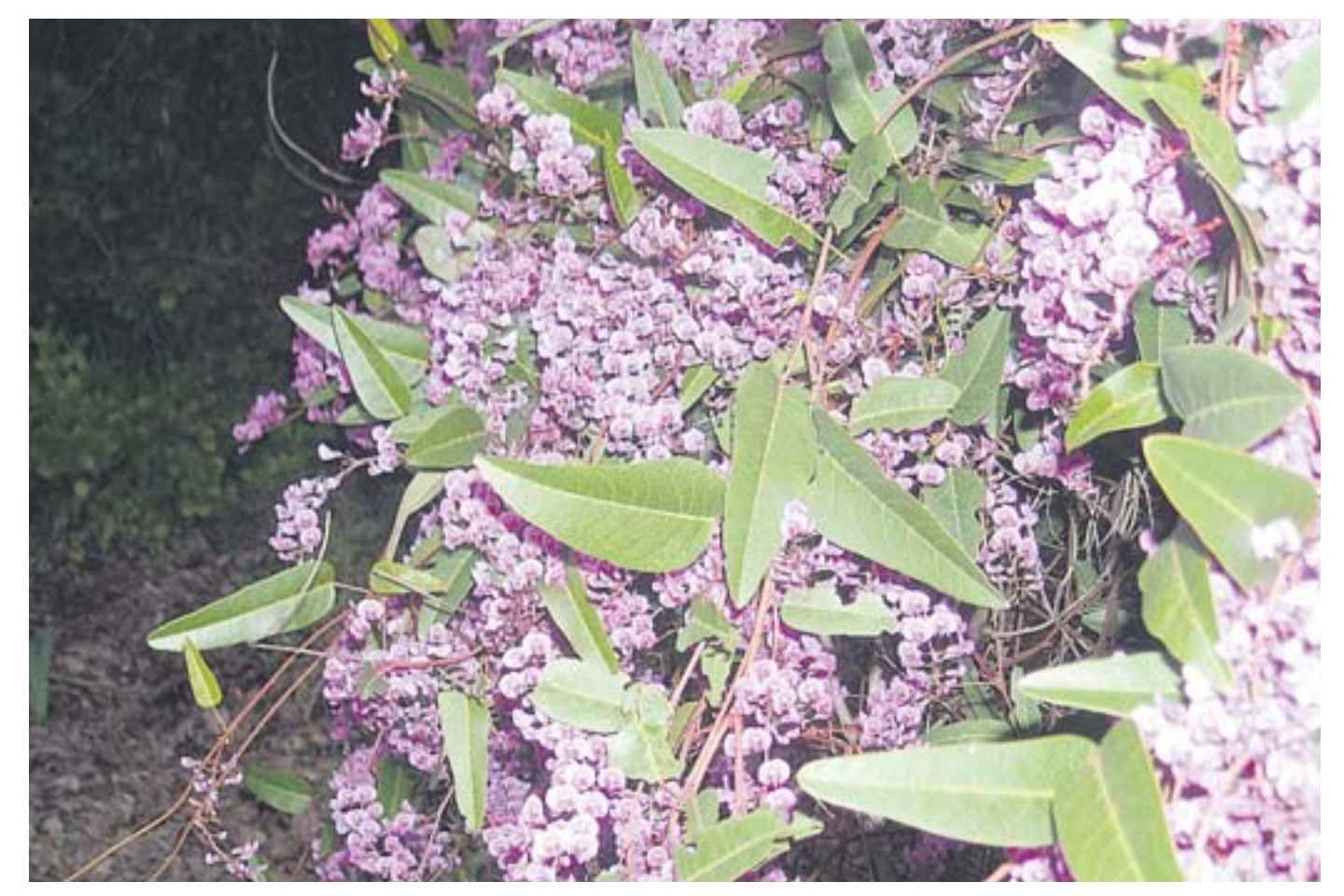
Purple Lilac Vine is a colorful winter blooming vine for fences, walls, and arbors. (Hardenbergia violaceae)

One of the items on my agenda for the year is to enrich my vegetable garden with compost, mulch, legume planting, and crop rotation. The date for each task is chronicled and I have written down in my gardening journal the specifics, how I will measure, achieve, be realistic, and time my endeavors. My reward will be a healthy harvest of delectable freshness that I'll be able to share with family, friends, and colleagues.