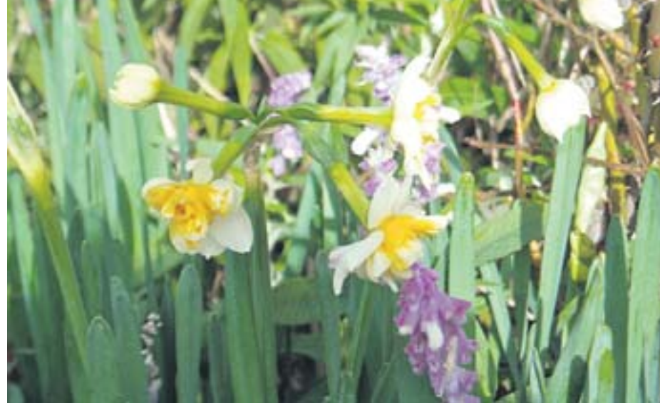
Narcissus mingled with Russian Sage brighten the winter landscape with beauty and perfume.