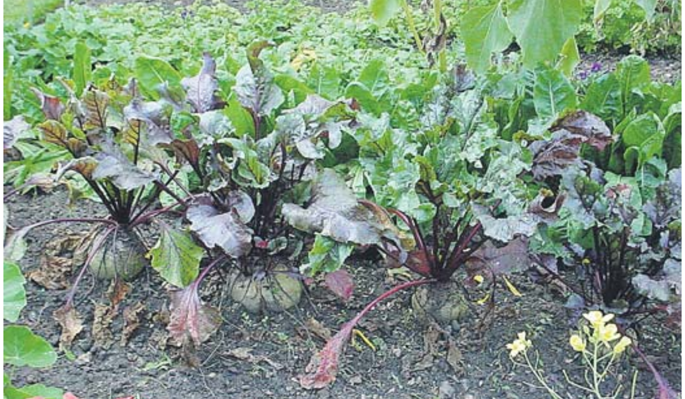
Beets ready to harvest along with winter greens.

Hard work, sacrifice, and commitment deserve applause. Create SMART garden goals and celebrate your diligence. Use the winter months to pause relax, and reinvent while you become the architect of your dreamscape. Plant purple lilac vines (Hardenbergia violaceae)to cover those fences and walls that you want hidden in winter.