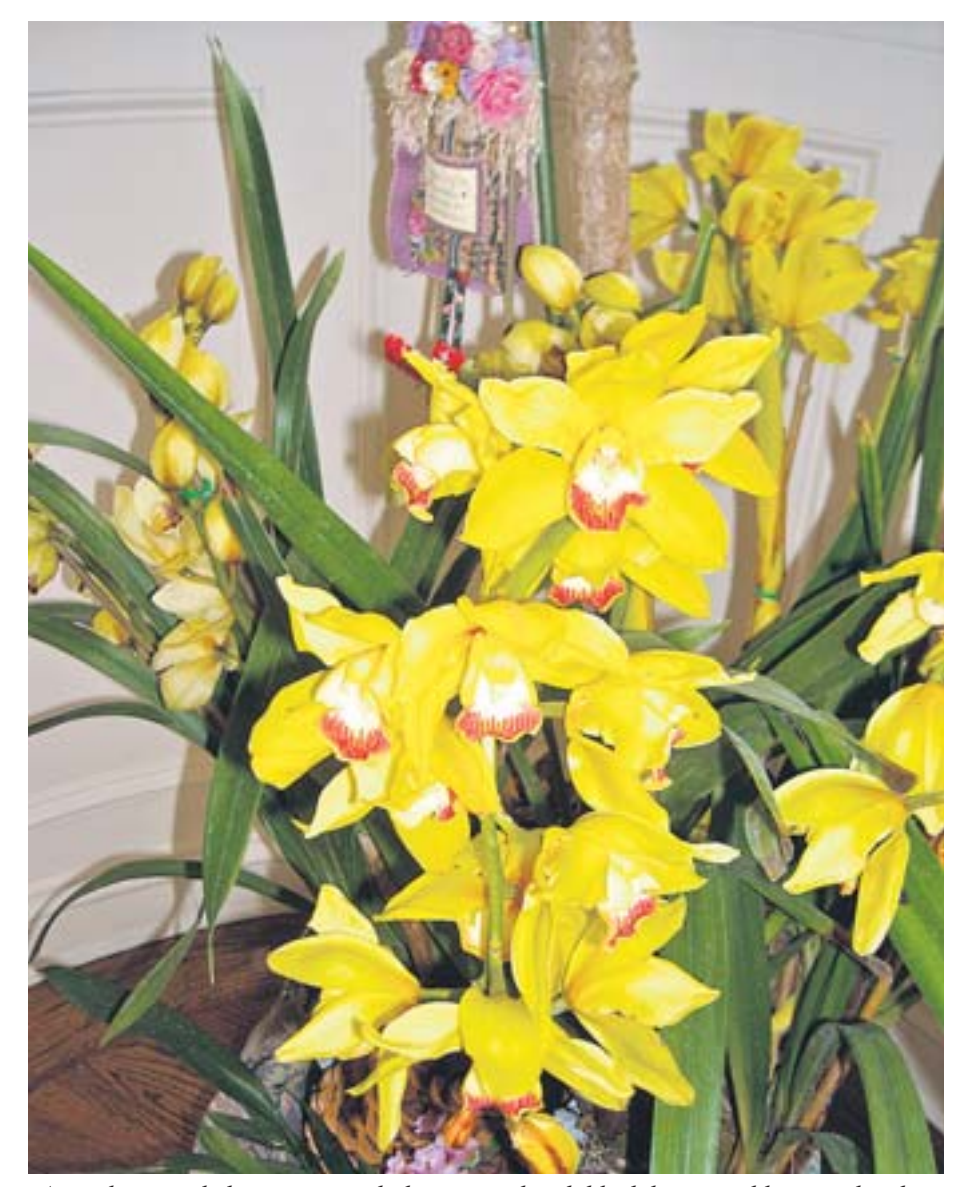
A scarlet tipped chartreuse cymbidium paired with blush bergenia blossoms brighten an indoor hall.