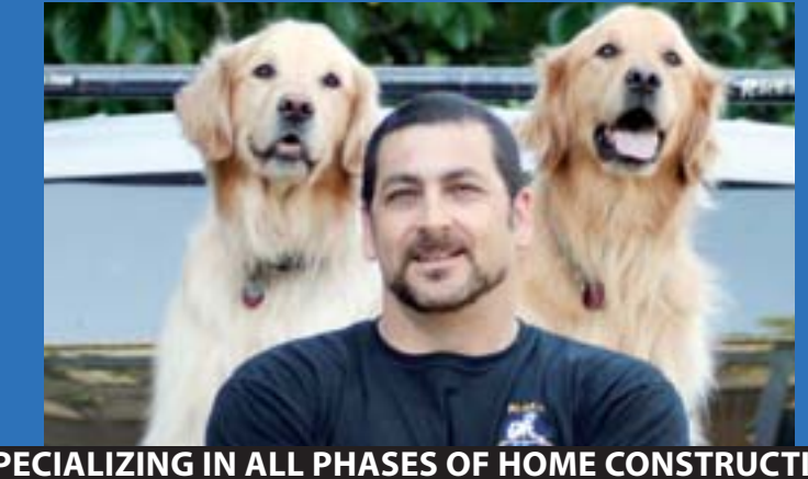
LOCATED IN LAMORINDA AREA 20th YEAR IN BUSINESS