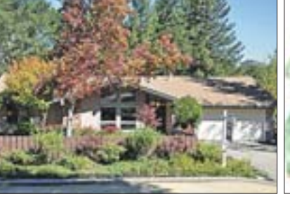
Orinda $1,025,00 5/2