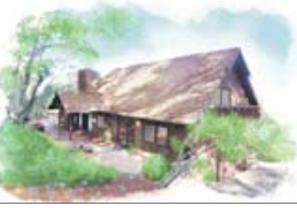
Orinda $775,000 2/2.5

5 Moraga Way | Orinda | 925.253.4600 • 2 Theatre Square, Suite 211 | Orinda | 925.253.6300