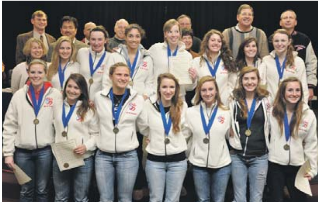
Campolindo's varsity volleyball team, with coaches and council members