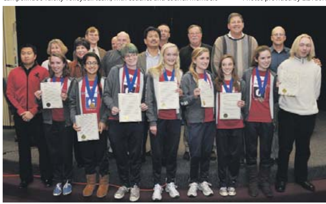
Campolindo's varsity cross country team and friends