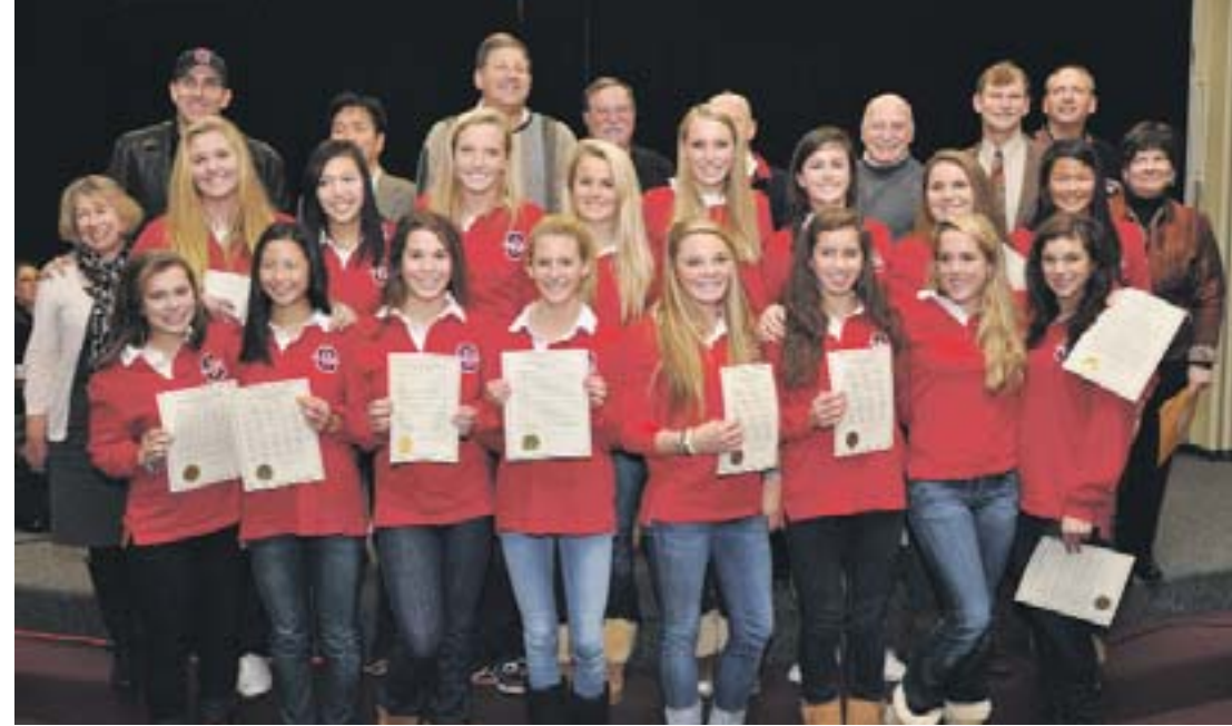
Campolindo's varsity water polo team (et al)