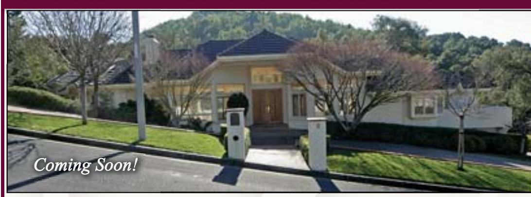
2 JULIANNA COURT, MORAGA Serenity and Exclusivity in Sanders Ranch!

This expansive and elegant executive home will be shortly coming to the market in Sanders Ranch. It is ideal for entertaining and the 4324 square feet are generously spread across the 3 Br, 3.5 Ba, full paneled office and large living spaces. The pool, spa and outdoor patio areas overlook the abundant open space in this great community.