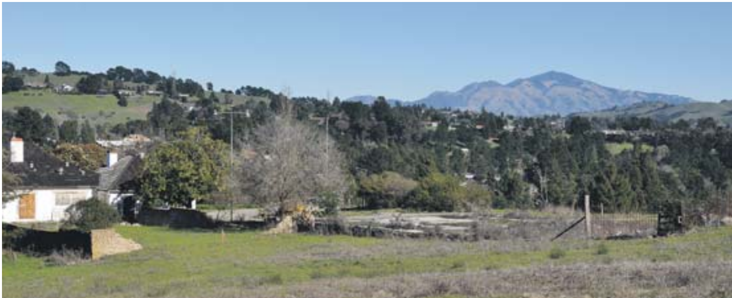
The Moraga Adobe (left), boasts a spectacular view of Mt. Diablo