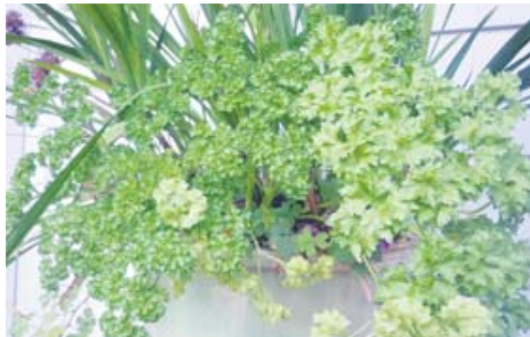
Deep green curly leafed parsley grown in a container from seed is a culinary perennial pleaser.

"I know that the seeds I sow I will harvest, because every action, good or bad, is always followed by an equal reaction. I will plant only good seeds this day." Og Mandino