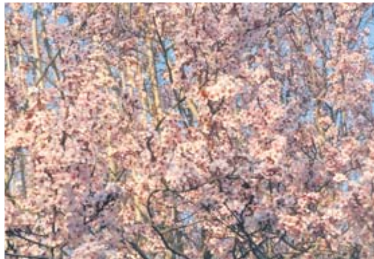
Plum trees' rosy blossoms perfume the Lamorinda skies.