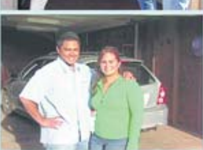
You've got a "Happier, Organized Life"!

TO START THE NEW YEAR OFF RIGHT, 5A HAS LOWERED PRICES ON A LARGE SELECTION OF STORAGE UNITS. VISIT OUR WEBSITE OR OUR FACILITY AND FIND OUT MORE ABOUT 5A's "SUPERIOR CUSTOMER SERVICES" AND NEW LOWER PRICES! WHEN YOU VISIT OUR FACILITY & TAKE A TOUR, WE'LL GIVE YOU A FREE ST. MARY'S GAELS