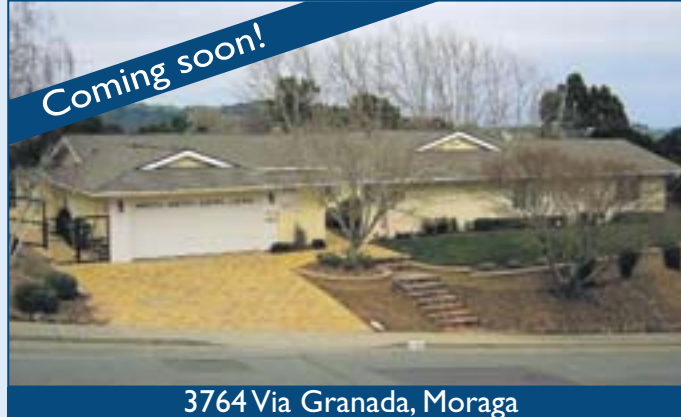
3764 Via Granada, Moraga

Completely remodeled and expanded Campolindo rancher. This home features 4 bedrooms, 3.5 baths and a full-equipped media room that could be used as an au pair /in-law suite. The chef's kitchen has marble counter tops, 6-burner Dacor range and much more. The family room has a built-in media center. Master bedroom suite with walk-in closet and luxurious bath. Spacious, level yard with lawn, patio, sports court, dog run, fruit trees and hot tub.