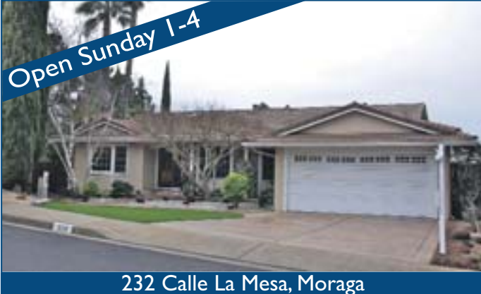
232 Calle La Mesa, Moraga

Updated single-story, 4 bedroom, 2 bath home with over .30 acre level yard with views, pool, spa, sauna & lawn. Granite, stainless & maple kitchen, tiled baths, hardwood flooring, dual-paned windows, skylights & new paint. Living room, formal dining, family room with raised ceiling opens to kitchen/dinette. Pool club, top schools & excellent commute location.