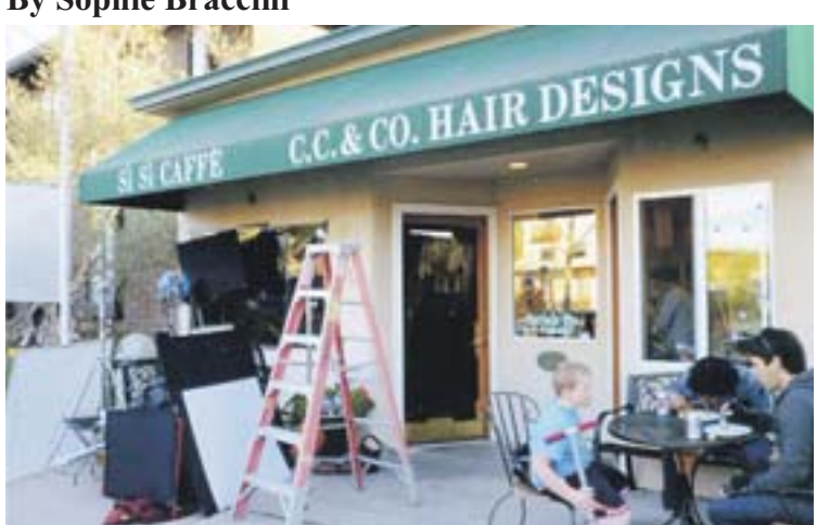
Camera set up at Si Si Caffe

ho'd have thought that Moraga might be the perfect setting for a thriller? If you're looking for some small town ambience, turns out Moraga's just the ticket.