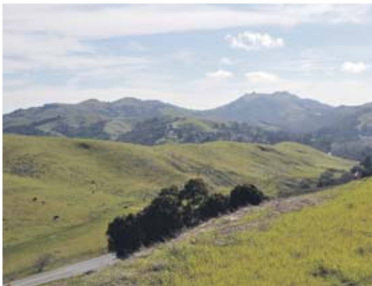
Rheem Ridge above Rheem Blvd.