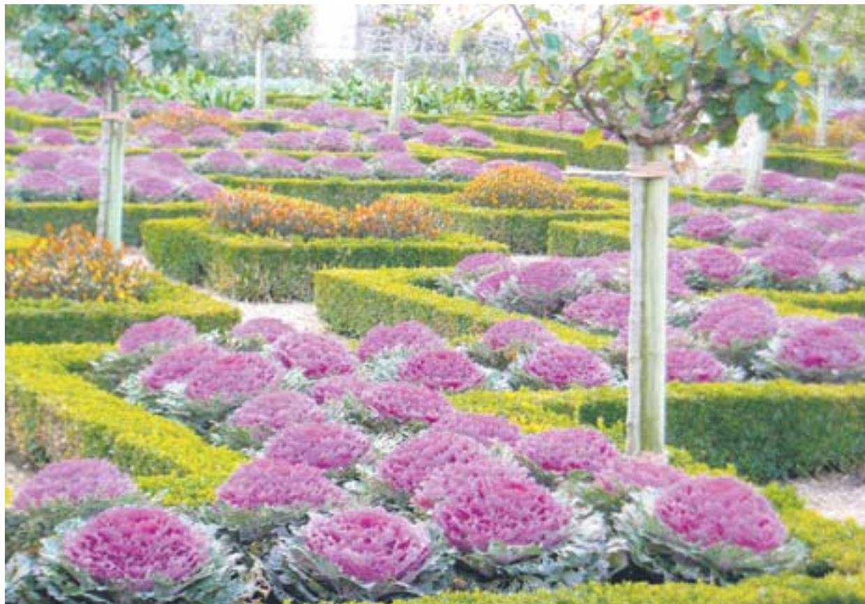
The magnificent formal potager at Chateau Villandry in France with purple kale, tree roses, and peppers edged with clipped boxwood.