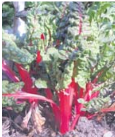
Ruby Swiss Chard.

Whether you are seeking a dazzling horticultural sculpture garden, or a modest vegetable area, a potager is the future for fresh, nutritious, hearty, healthy food in abundance.