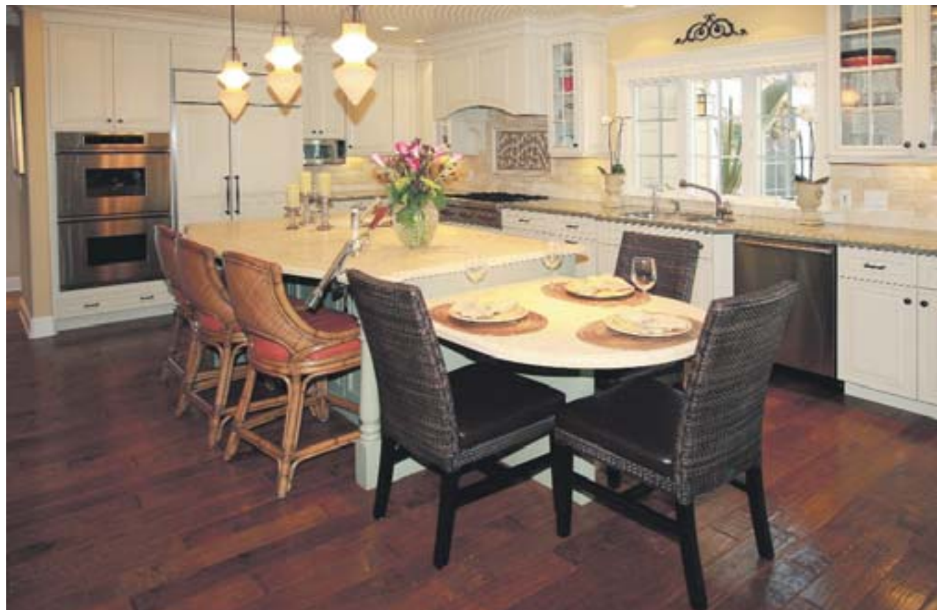
Lance and Kari Grosz's kitchen functions perfectly for family living and entertaining.