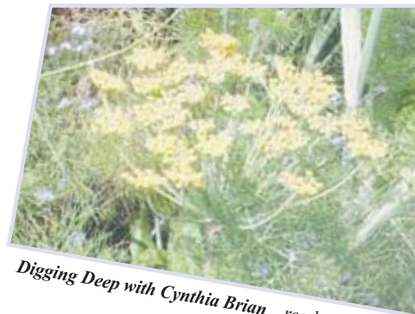
Digging Deep with Cynthia Brian ...read on page D8

Lamorinda Weekly Volume 05 Issue 4 Wednesday, April 27, 2011