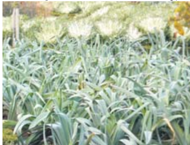
Leeks and cabbages are the stars of the kitchen potager.

Potagers are mostly filled with annuals as opposed to permanent plantings of perennials to allow for rotation and choice. The secret is to blend plants that are edible or are useful as natural pest and insect resistors. When creating your