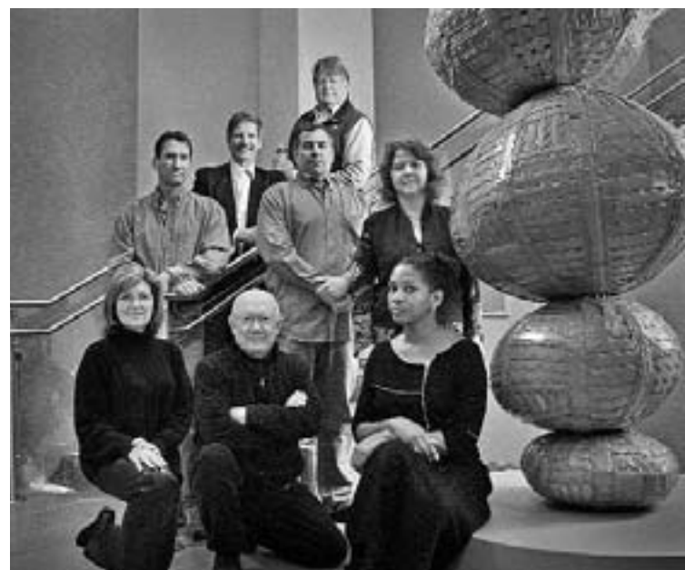
The Public Art Committee