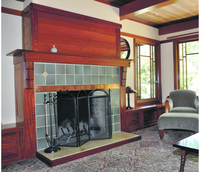
Steve Kauffman's fireplace, created in a combination of wood, tile, and copper