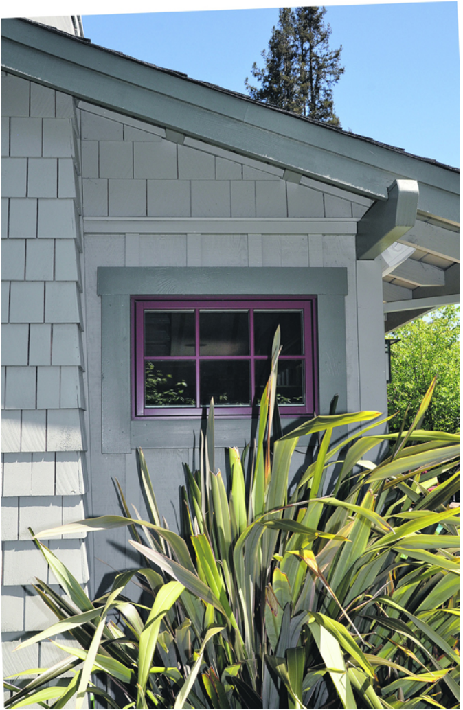
Red windows contrast beautifully with the dark green-grey outside walls on the Hathaway home

"We've been back in the house for four years now," says Hathaway, "the neighbors love it and it is a perfect space for our family."