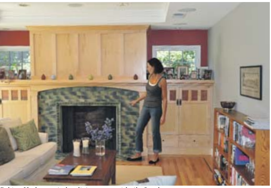
Sabine Hathaway in her living room with tile fireplace