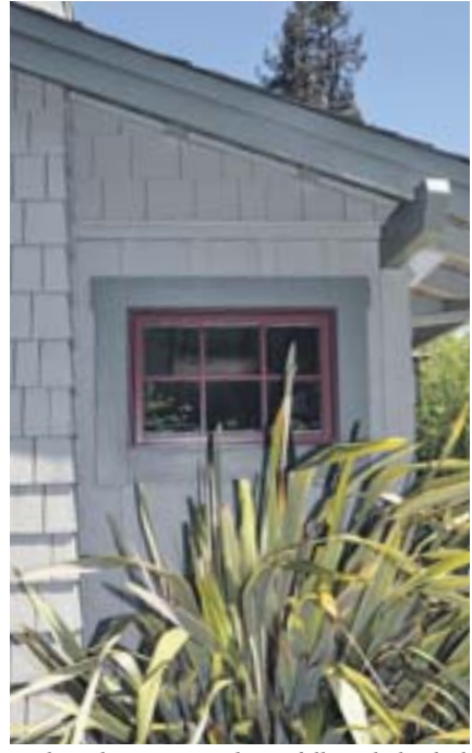
Red windows contrast beautifully with the dark green-grey outside walls on the Hathaway home