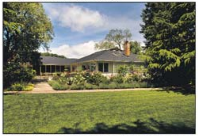
Extraordinary Gated Estate in Treasured Location! Sprawling Lawns, Breathtaking Gardens 6 BR 7+ BA 6,641 Sq Ft Totally Private 1.34 Acres Ideal Guest/Au Pair Quarters, Covered 6 Car Parking Offered at $4,250,000