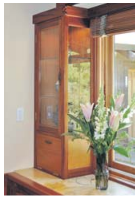
The Kauffman home boasts charming interior details.