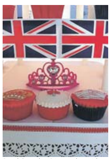
Royal Cupcakes (citrus cakes with fondant topping) are sweets fit for a princess!

were in place, and Union Jacks fluttered in the breeze. Honored guests were dressed to the nines. It was time to celebrate the April 29th marriage of Will and Kate. But this was not London—this was Lafayette. This was a Royal Wedding Tea Party hosted for twenty five elementary school children and their parents, all friends of Caroline Somary. On sun-drenched backyard tables piled high with craft supplies, guests drew London doubledecker busses, assembled floral beautiful little town," Somary bouquets, corsages and made said of his generous gesture. royal figures and miniature cas-