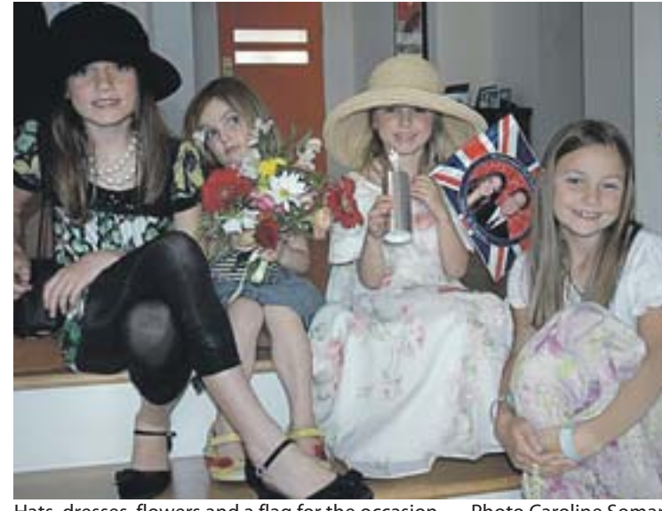
Hats, dresses, flowers and a flag for the occasion

For Somary the event was tles. The menu featured apple less about "princess glitter" and