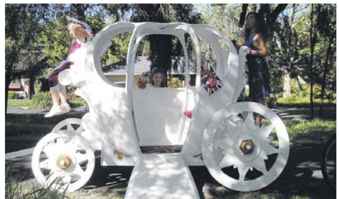
Wedding guests wait for their princes in the carriage