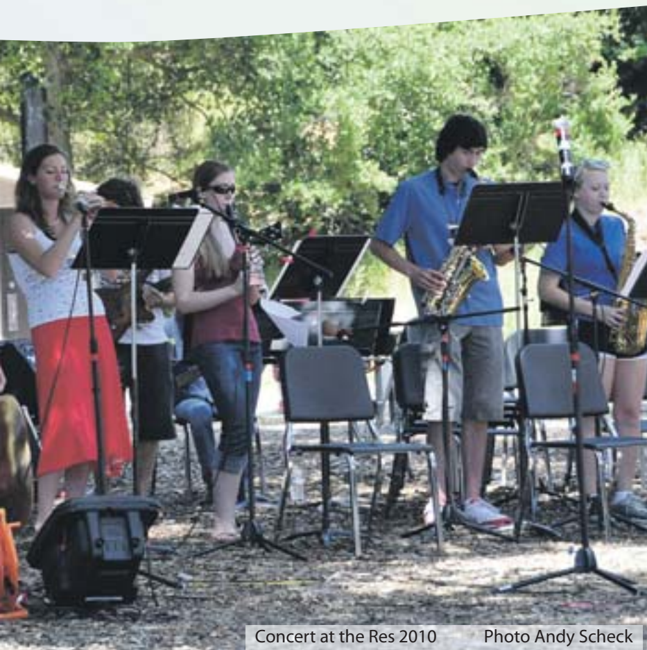
Concert at the Res 2010