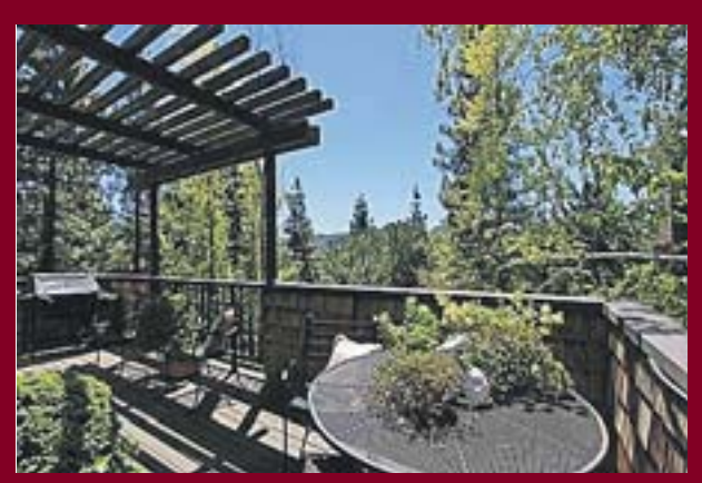
220 The Knoll, Orinda