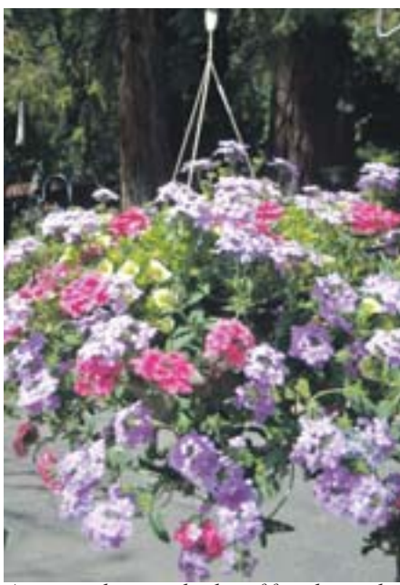
A summer hanging basket of fuscshia and violet hued verbena looks perfect on the patio.

Nosegays (fragrant flowers to keep the nose happy), posies (small bouquets of sweet smelling flowers worn around the head or bodice), tussie-mussies (symbolic flower fashion accessories wrapped in lace and tied with satin ribbon) and sachets (perfumed bags) are as appropriate in the 21stcentury as they were in the 19th.