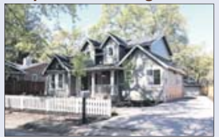
New construction! 5 bedrooms, 4 baths, 3100 sq.ft, flat lot. Offered at $ 1,895,000