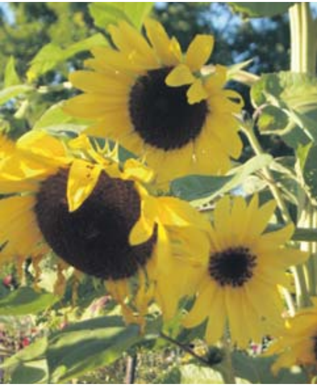
Sunflowers are the perfect flower for the graduate as they shout "Congratulations!"

Depending on the source, there may be multiple meanings for the same specimen, sometimes with completely opposing connotations. Color and number of stems may also weigh into the interpretation for the recipient, especially when it comes to the rose, which enjoys the status of the plant with the most definitions. For example, a red rose implies passionate love, whereas a crimson rose indicates mourning. A fresh white rose speaks of innocence and purity while a dried white rose denotes "death is preferable to loss of virtue!" The significance of giving ten roses signifies that "you are perfect", thirteen roses means "friends forever", fifteen roses says "I'm truly sorry", twenty-four roses kisses with "forever yours" whereas twenty five roses signs "congratulations." Perhaps it would be wise to count properly as we wouldn't want to confuse those numbers and import the incorrect gist. If you are contemplating a marriage proposal, 108 red roses on a bended knee whispers, "Will you marry me?"