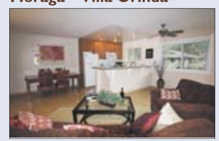
2 bedrooms, I bath, open floor plan, garage. Next to Moraga Country Club. Offered at $239,000