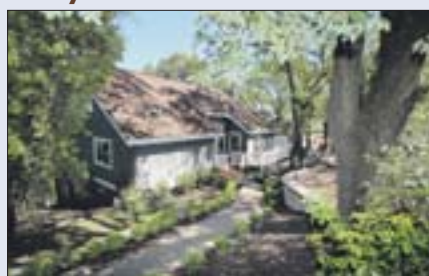
4 bedrooms, loft, 2 1/2 baths, appx. 1921sq.ft., over a half acre. Offered at $799,000