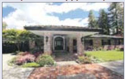
5 bedrooms, 6 baths, appx 6,603 sq.ft., 1.3 acres! Tennis ct, pool/spa, guest house. Offered at $2,650,000