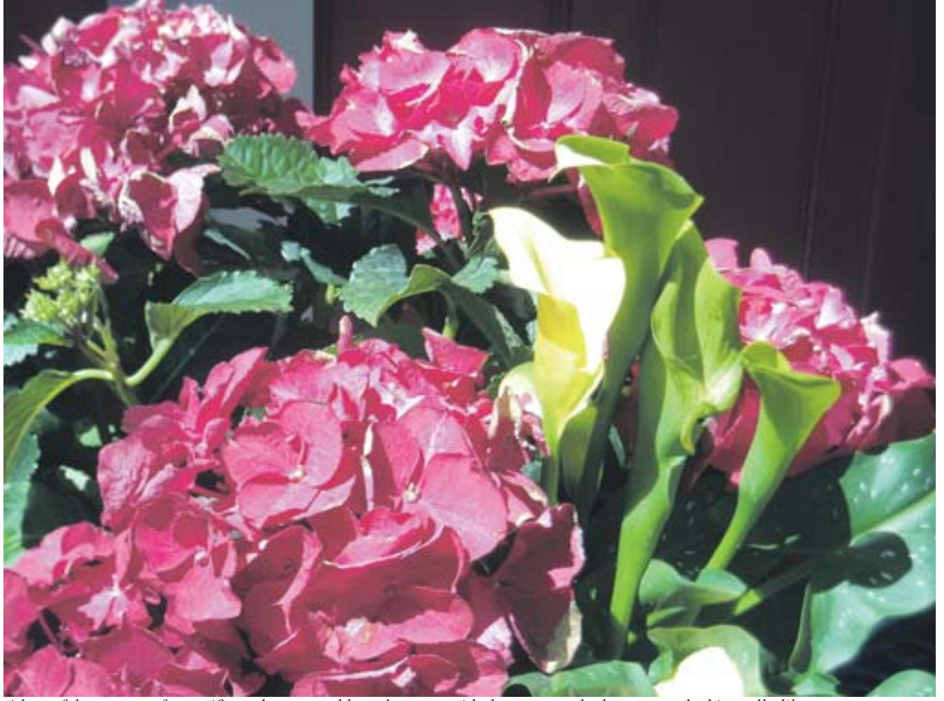
A boastful message of magnificent beauty and heartlessness with the magenta hydrangea and white calla lily.

"Flowers are Love's truest language!" Park Benjamin