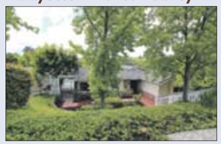
4 bedrooms, 2 baths, over 2000 sq. ft., 1/4 acre lot. Walk to school. Offered at $859,000