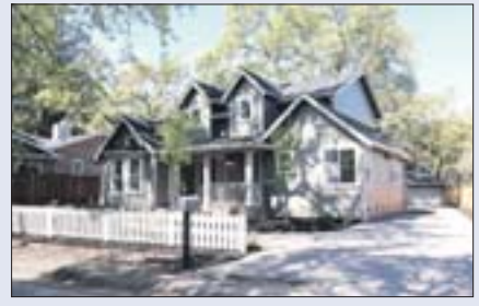
New construction! 5 bedrooms, 4 baths, 3100 sq.ft, flat lot. Offered at $ 1,895,000