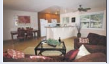
2 bedrooms, I bath, open floor plan, garage. Next to Moraga Country Club. Offered at $239,000