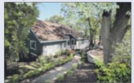
4 bedrooms, loft, 2 1/2 baths, appx. 1921sq.ft., over a half acre. Offered at $799,000