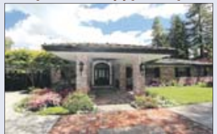
5 bedrooms, 6 baths, appx 6,603 sq.ft., 1.3 acres! Tennis ct, pool/spa, guest house. Offered at $2,650,000