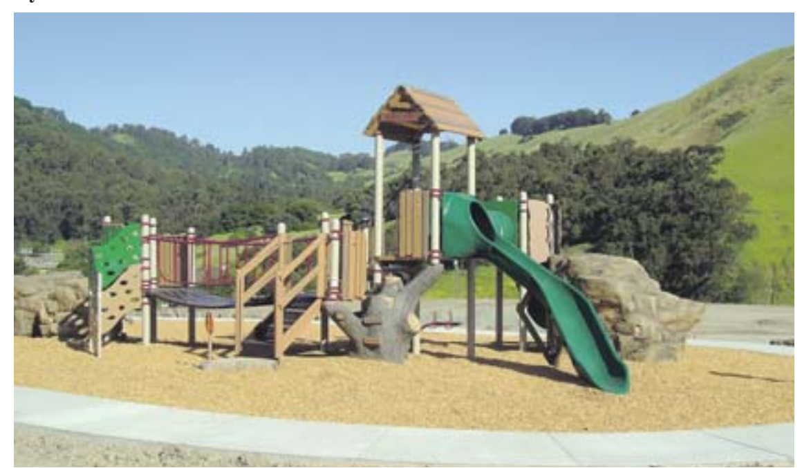
The new tot lot will not be open to the public until the playfields are ready