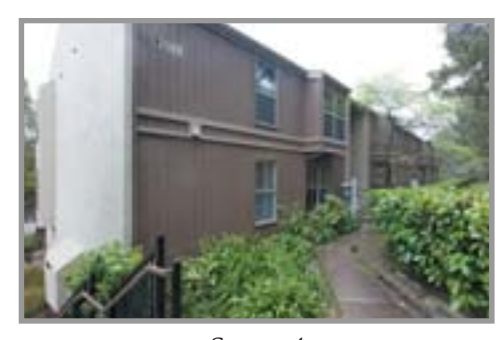
SOLD! 2091 Ascot Drive #127 2BR/2BA, 1144± Sq. Ft. Offered at $219,900

Moraga Resident since 1966. Successfully selling real estate for over 25 years.