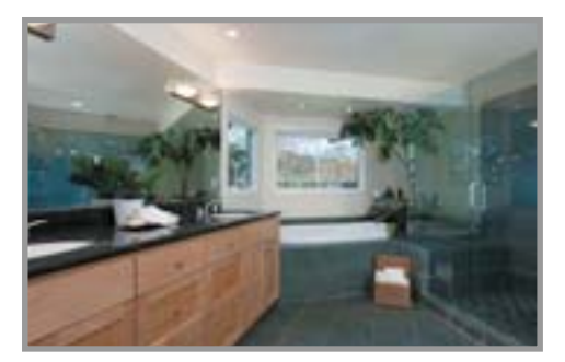
SOLD! 3 Roberts Court 4BR/2.5BA, 2162± Sq. Ft. Offered at $819,000

VISIT WWW.PACUNION.COM TO SEARCH PROPERTIES & GET EMAIL ALERTS!