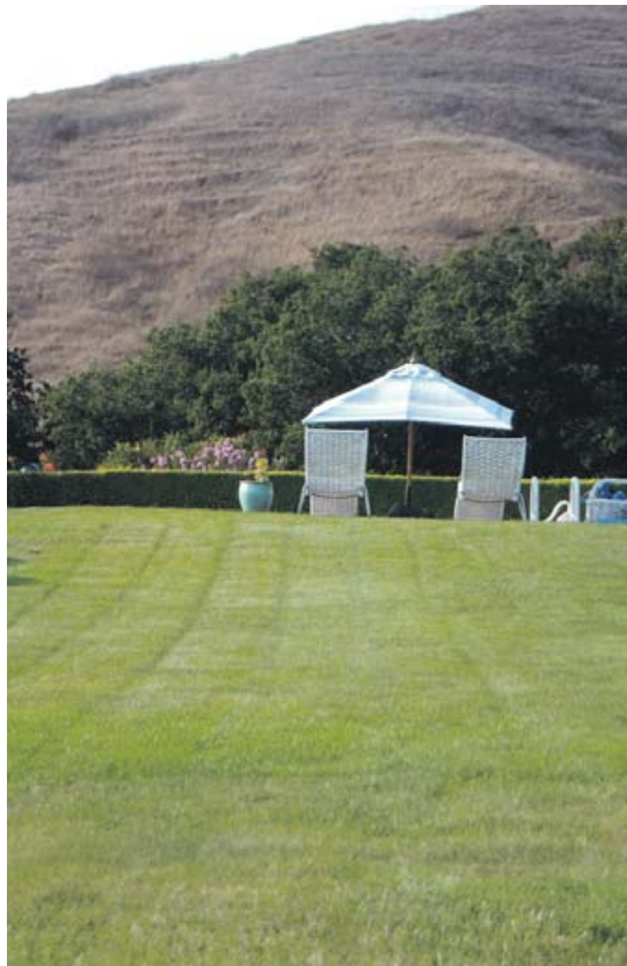
Lush, green, verdant lawns are for playing, cartwheeling, and memory making