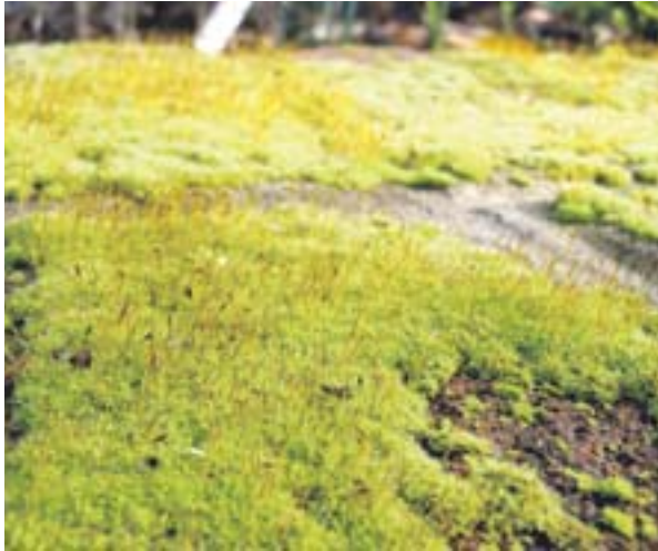
A close up of moss, a soft rug for small, damp areas.

If you've had a difficult time growing anything in your yard, get your soil tested and contact the University of California Extension office for advice. Once the site is level, the soil has been tilled and enriched, you are ready to scatter your seed or roll out the sod. If you have a small area to beautify, throwing seed covered in peat moss may be the best decision. I recommend netting the square to keep the hungry birds away from this dining buffet.