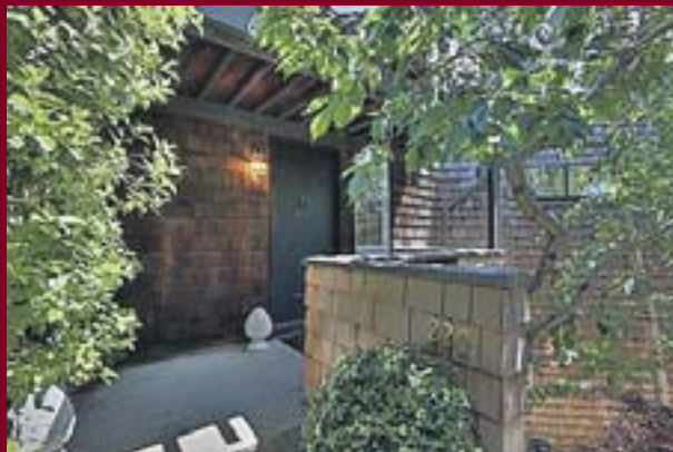
220 The Knoll, Orinda