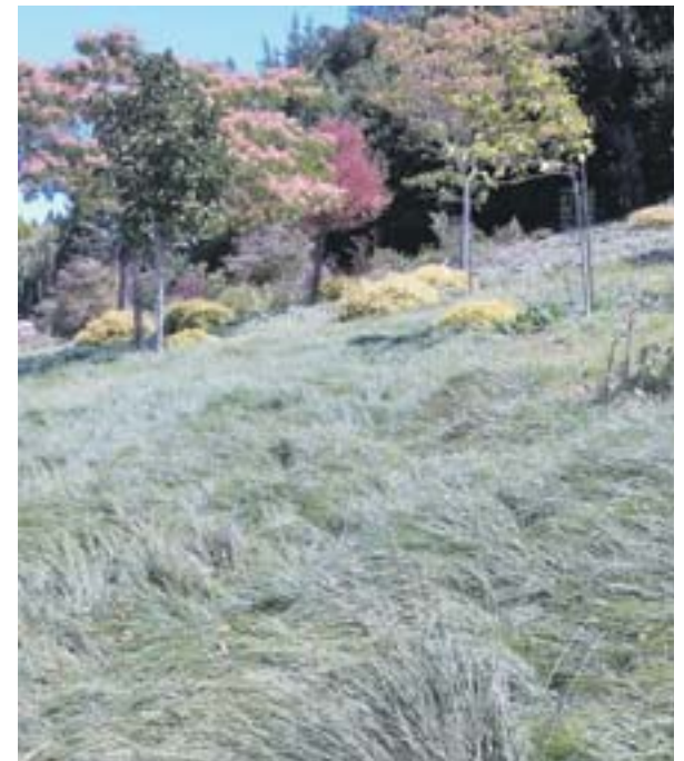
A sea of waving silver tipped ornamental grasses graces the hillside with watermelon crepe myrtle and the pink puffs of the Silk Tree in the background.

Here's to cartwheels, sow bugs, hoses, and running barefoot through the grass. Long live lawns!