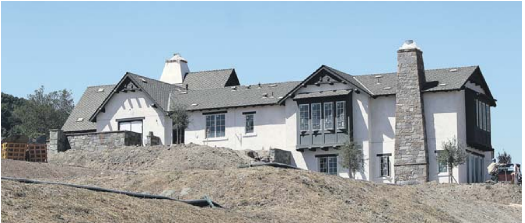
Construction is nearly complete on a new home at Wilder.