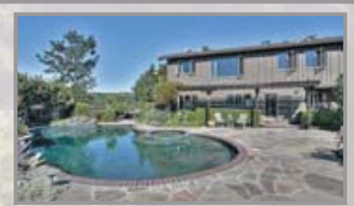
SOLD! 295 Calle La Mesa, Moraga 5BR/3BA, 2657± Sq. Ft. Offered at $1,175,000