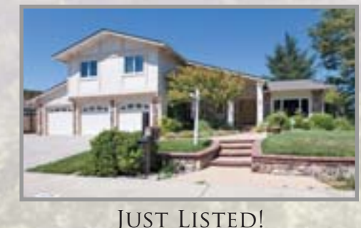
JUST LISTED! 428 Zinfandel Cir, Clayton 4BR/2.5BA, 2391± Sq. Ft. Offered at $629,000

Moraga Resident since 1966. Successfully selling real estate for over 25 years.