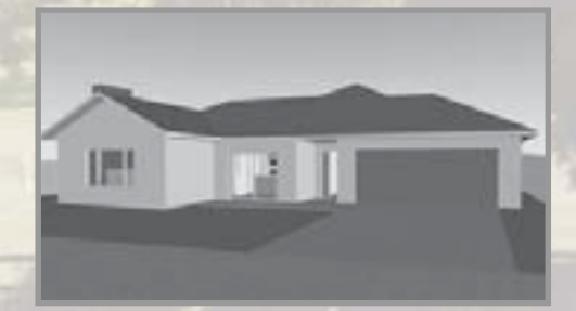
RESERVED FOR YOUR HOME!