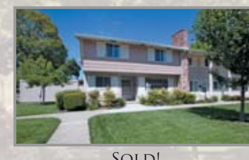
SOLD! 201 Miramonte Dr, Moraga 3BR/3BA, 1828± Sq. Ft. Offered at $415,000