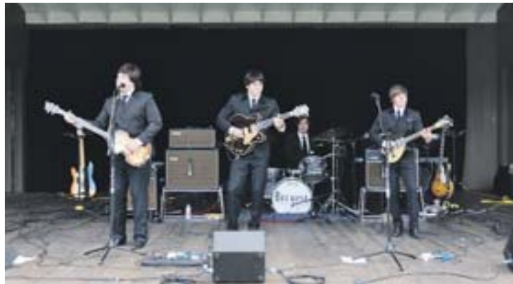
The Beatles tribute band Because played at the Commons on August 4.

During its August 24 meeting, the Moraga Town Council voted unanimously to rescind an ordinance that it had passed at the end of 2008, which aimed at exempting the Town from the limitations of its sound ordinance in an effort to protect itself from lawsuits pertaining to noise from events such as the summer concert series at the Moraga Commons Park. A resident challenged that ordinance and the Court ruled in her favor, leaving the Town no choice but to discard the rule.