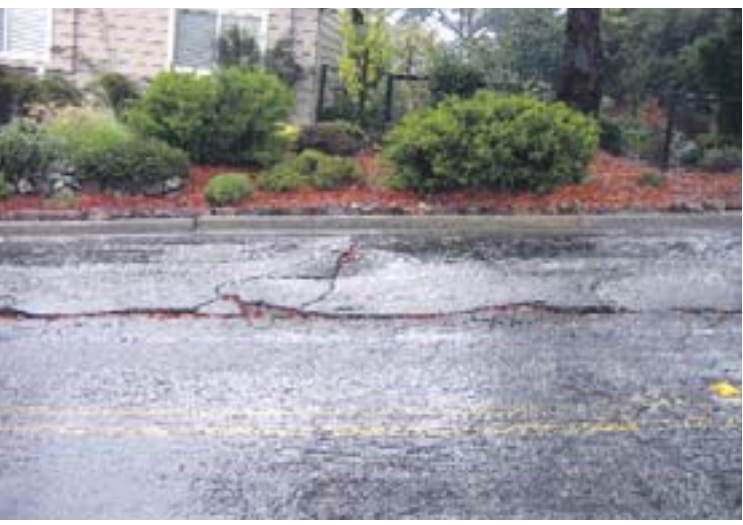
Urgent issues such as this one on Zander Drive receive priority attention from Orinda's Public Works and Engineering Department.