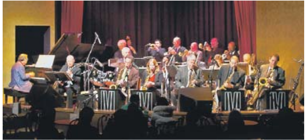
Yoshi's Oakland, 12/08