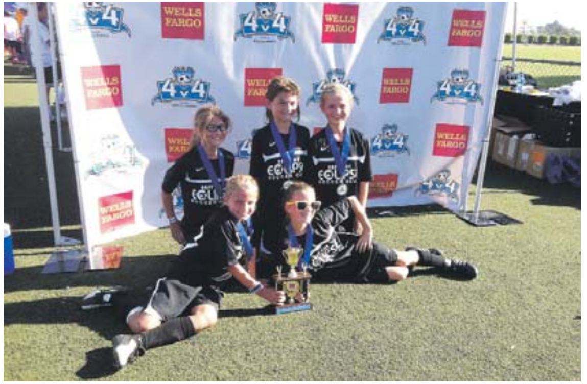
Eclipse U11 celebrate their tournament win