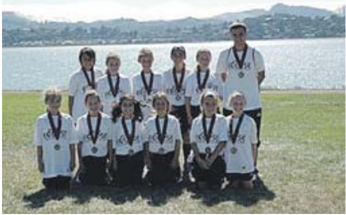
U12 Eclipse girls celebrate moving on to the medal round

offensive explosion to advance to Eclipse teams had a fun experithe medal round of the tourna- ence at the tournament thanks to ment. The girls won their tourna- the positive learning environment