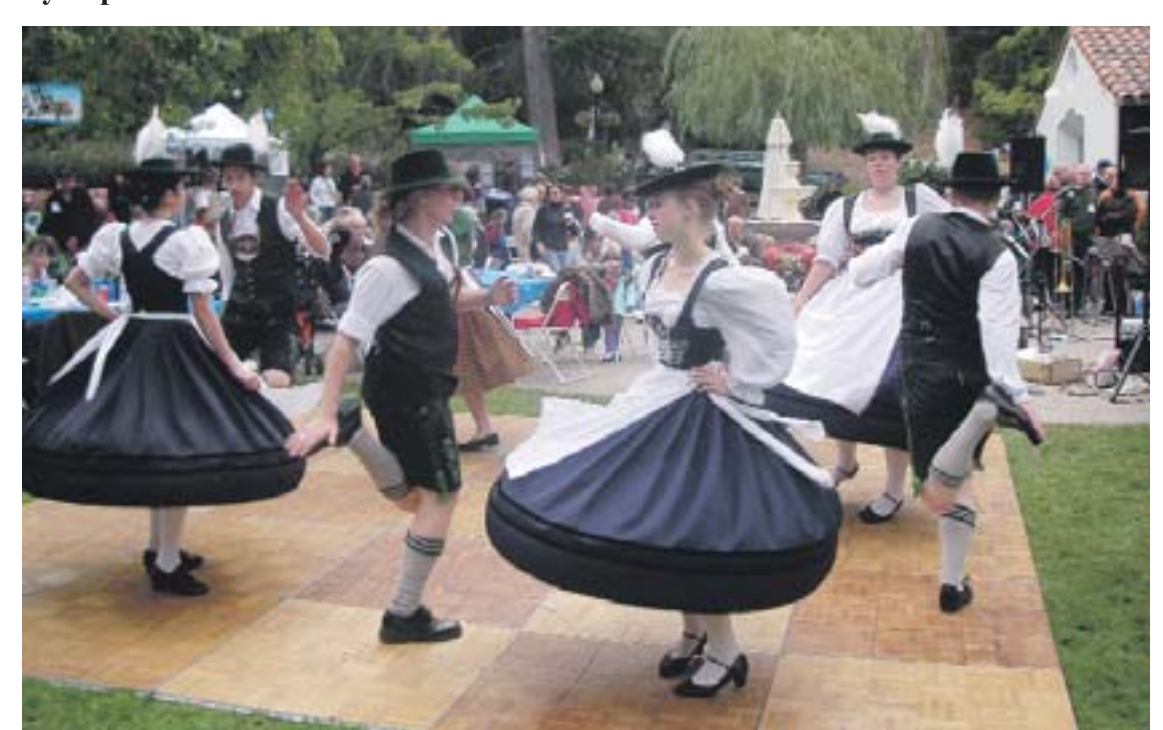
Bavarian Dancers will return to the Hacienda to perform at this year's Oktoberfest

he Hacienda Foundation hosts nity to enjoy the Hacienda and to its third annual Oktoberfest in Moraga on the third Sunday in October, featuring traditional German food, music, dancers and drinks, as well as kids' activities, on the beautiful grounds of the historic Hacienda de las Flores. for a family.