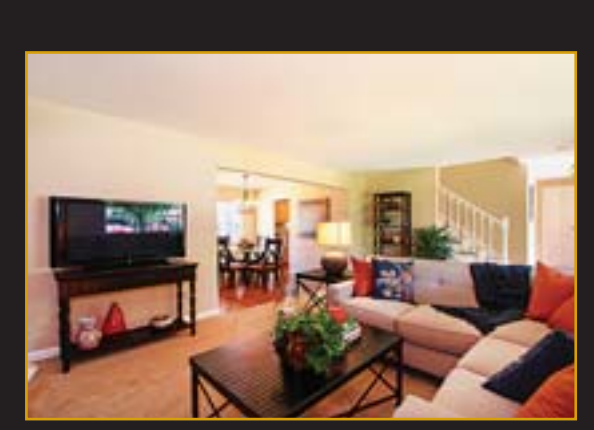
230 Sheila Court, Moraga

at the total end of Monticello in the Happy Valley area with a level pad and amazing views. Over 7.5 acres for your custom paradise. Enjoy nature amongst the beautiful oak trees and a trail from the property to Briones Ridge. Perfect for horses or a vineyard. www.monticelloestatelot.com $1,195,000 Alan Marks