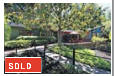
30 Crest Road