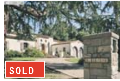
1609 Las Trampas