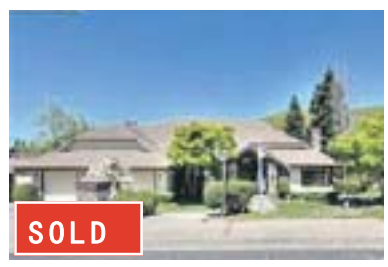
9 Merrill Drive