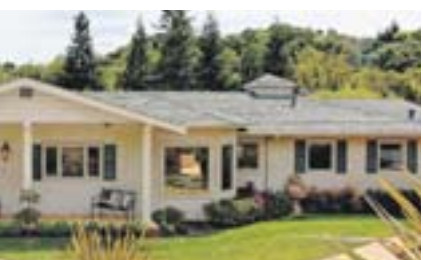
Del Rio, Lafayette