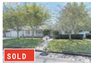
452 Millfield Place