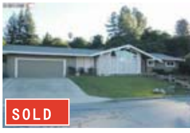
1588 Del Monte Ct.