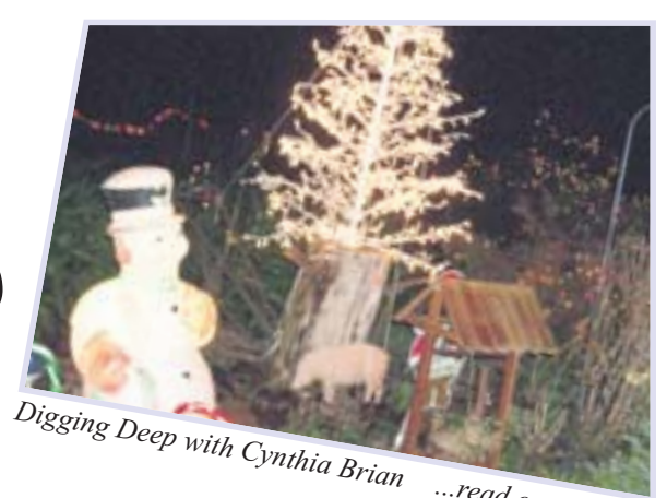
...read on page D2

Lamorinda Weekly Volume 05 Issue 20 Wednesday, December 7, 2011