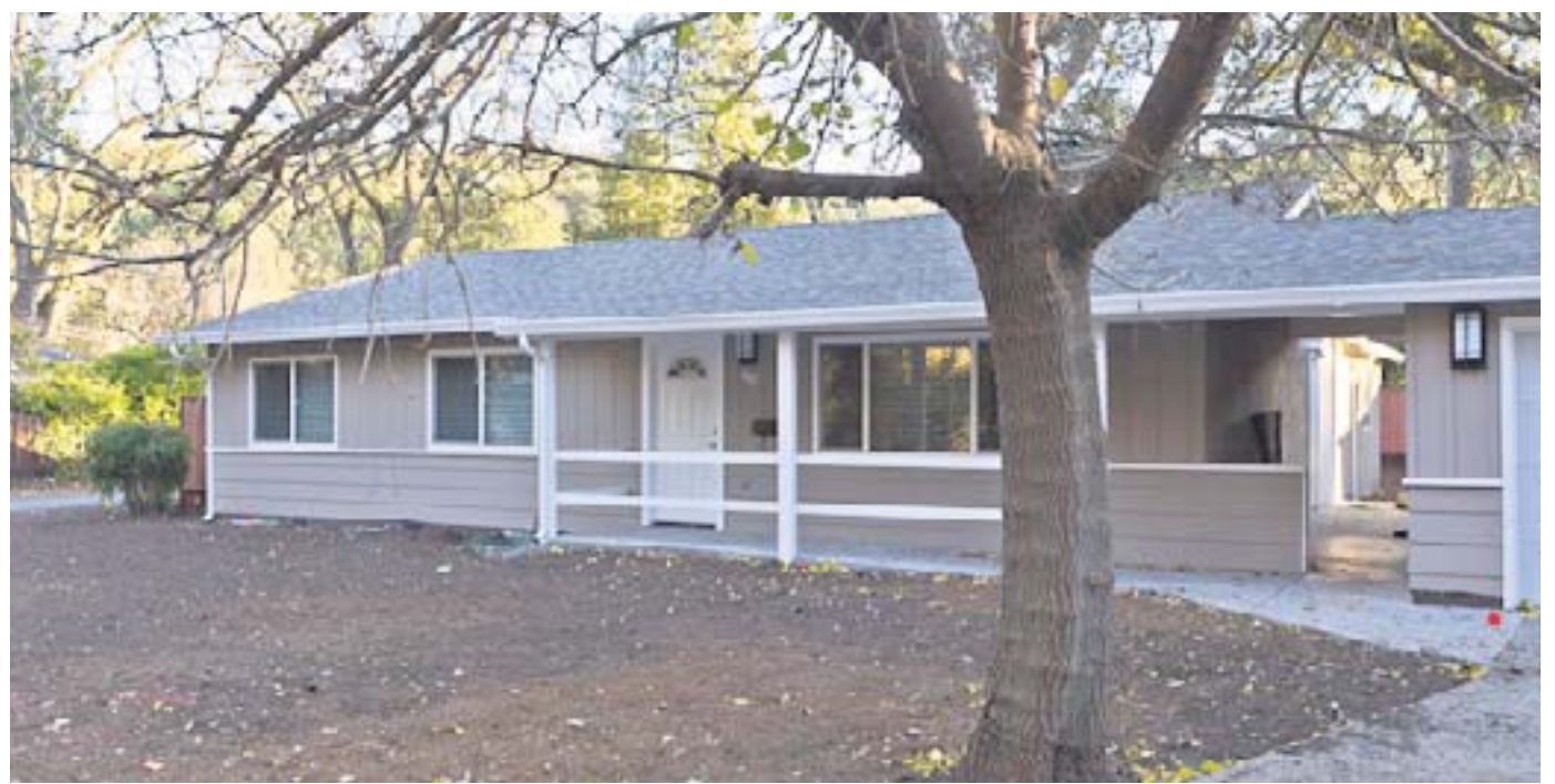
Unassuming on the outside, the interior of the home has been designed to be usable by everyone.