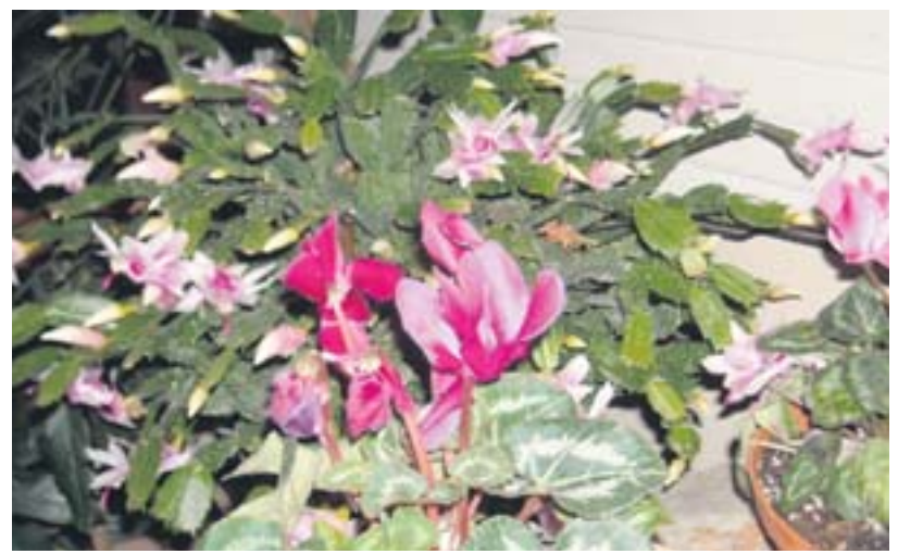
Cyclamen with Christmas Cactus in the back

For a hoe, hoe, hoe holiday sparkle, plant memories and grow green with aesthetically arresting home grown gifts from your garden that really show you care and share.