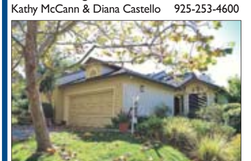
WALNUT CREEK 3/2.5. Executive Townhome with Lafayette Schools, VIEWS - Close to Freeway, BART, Local Shopping, Hiking and so much more!