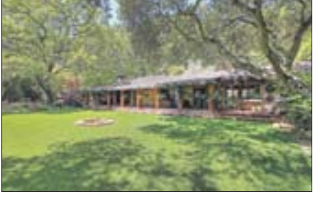
5/3.5. California Estate situated on 2.50 acre lot. Grand LR w/soaring redwood beamed ceilings. Views, Views!