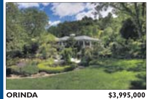
5/4. Pure Elegance! Situated on a gated

4/4. Secluded Sleepy Hollow Estate. Gracefully