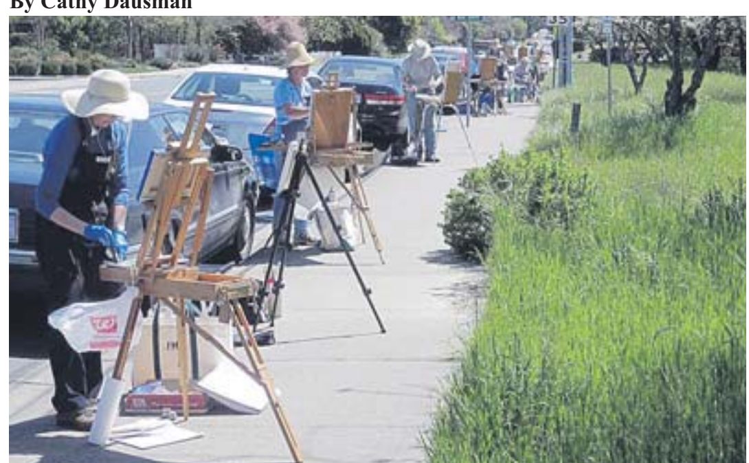
The Orinda landscape painting group at an old pear orchard in Moraga last spring.